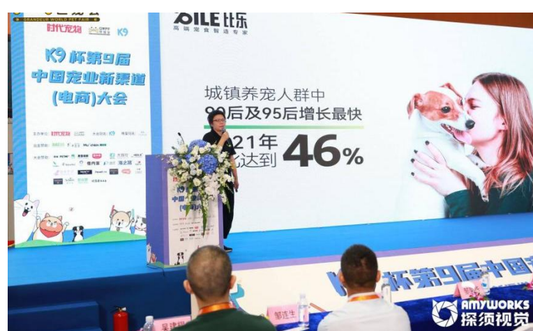
The 9th China Pet Industry New Channels (E-Commerce) Conference