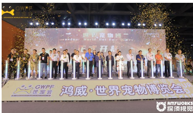
Opening Ceremony of the 2023 Grandeur World Pet Fair