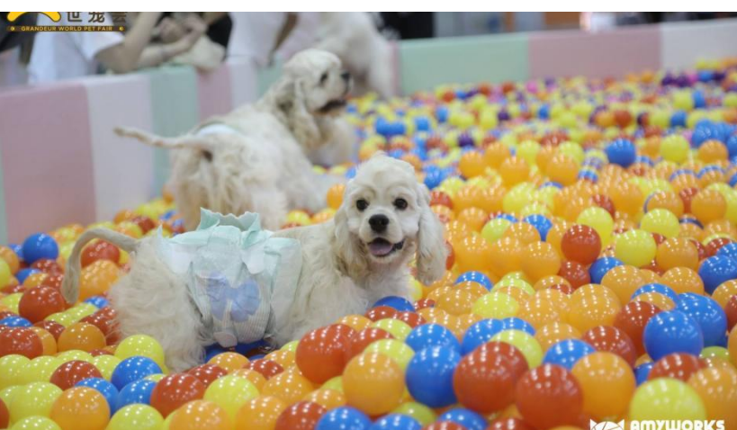
10,000 sq.m of Indoor Pet Theme Park