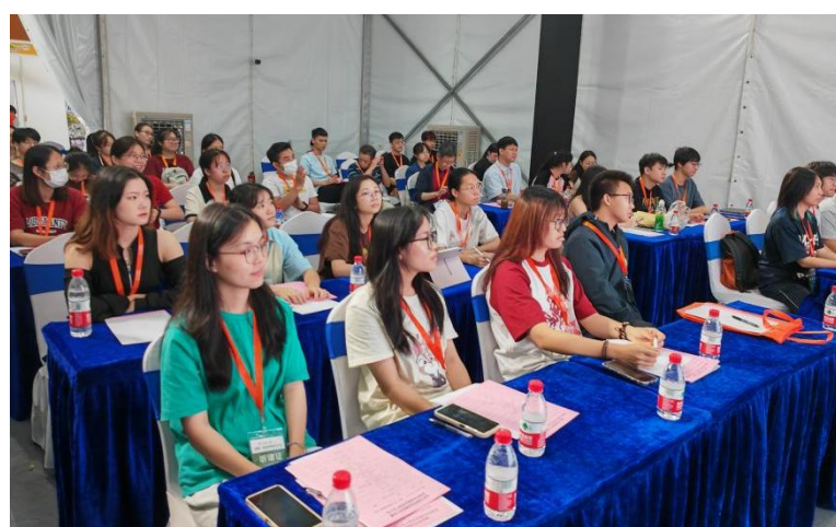
2023 China Companion Animal Medicine Conference