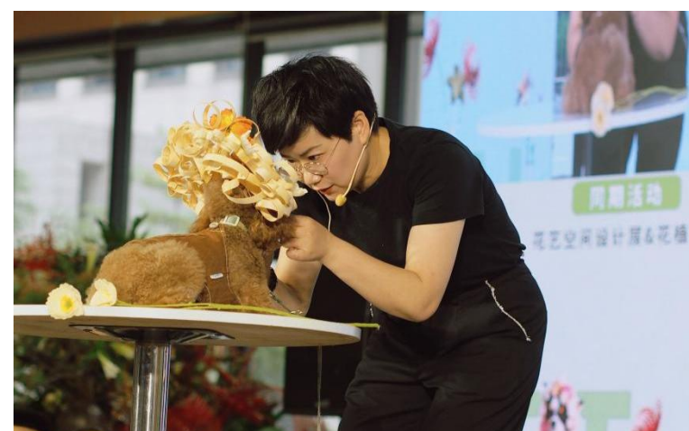
Pet Floral Design Festival & Flower Arrangement Show