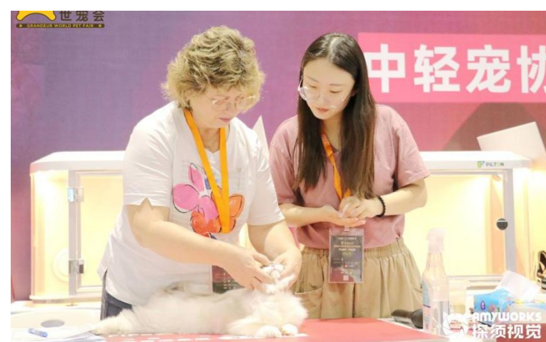
Fife International Purebred Cat Show